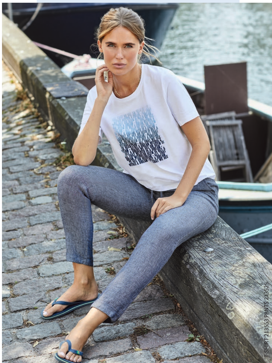
T-SHIRT 213553 PANTS 213525

Airy fabrics are perfect for lovely summer days by the water! The beautiful blue colour hues reflect the shades of the sky and the sea. B.Coastline offers a casual wardrobe for women with an active lifestyle, and each season the brand takes new initiatives to protect our environment. Look for the B.Conscious label.