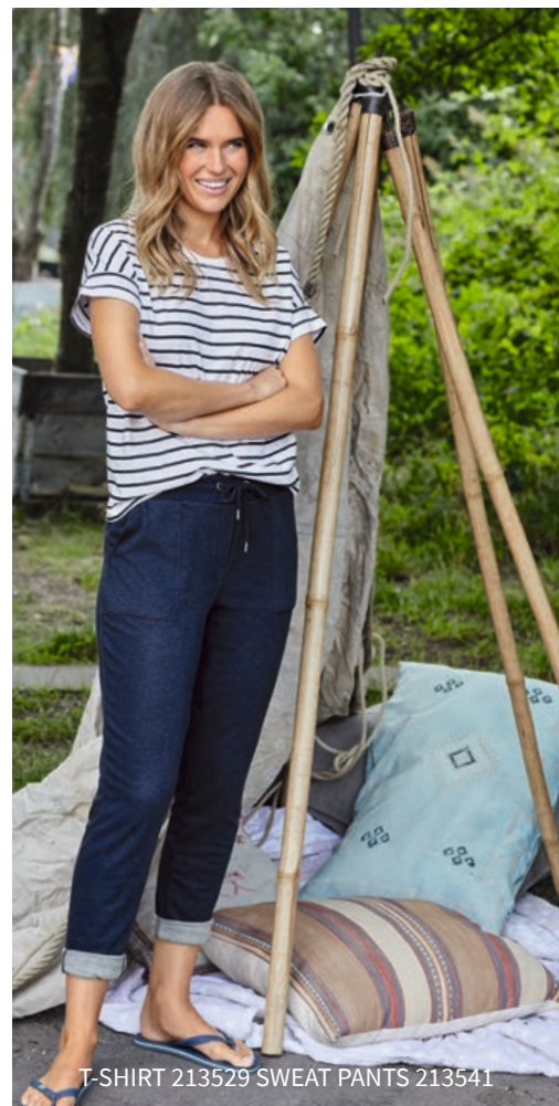
T-SHIRT 213529 SWEAT PANTS 213541